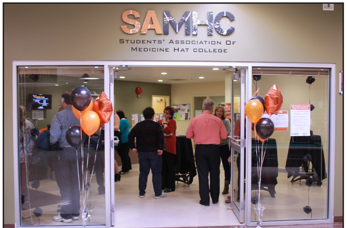
The Students' Associatin hosted an Open House on January 31st.