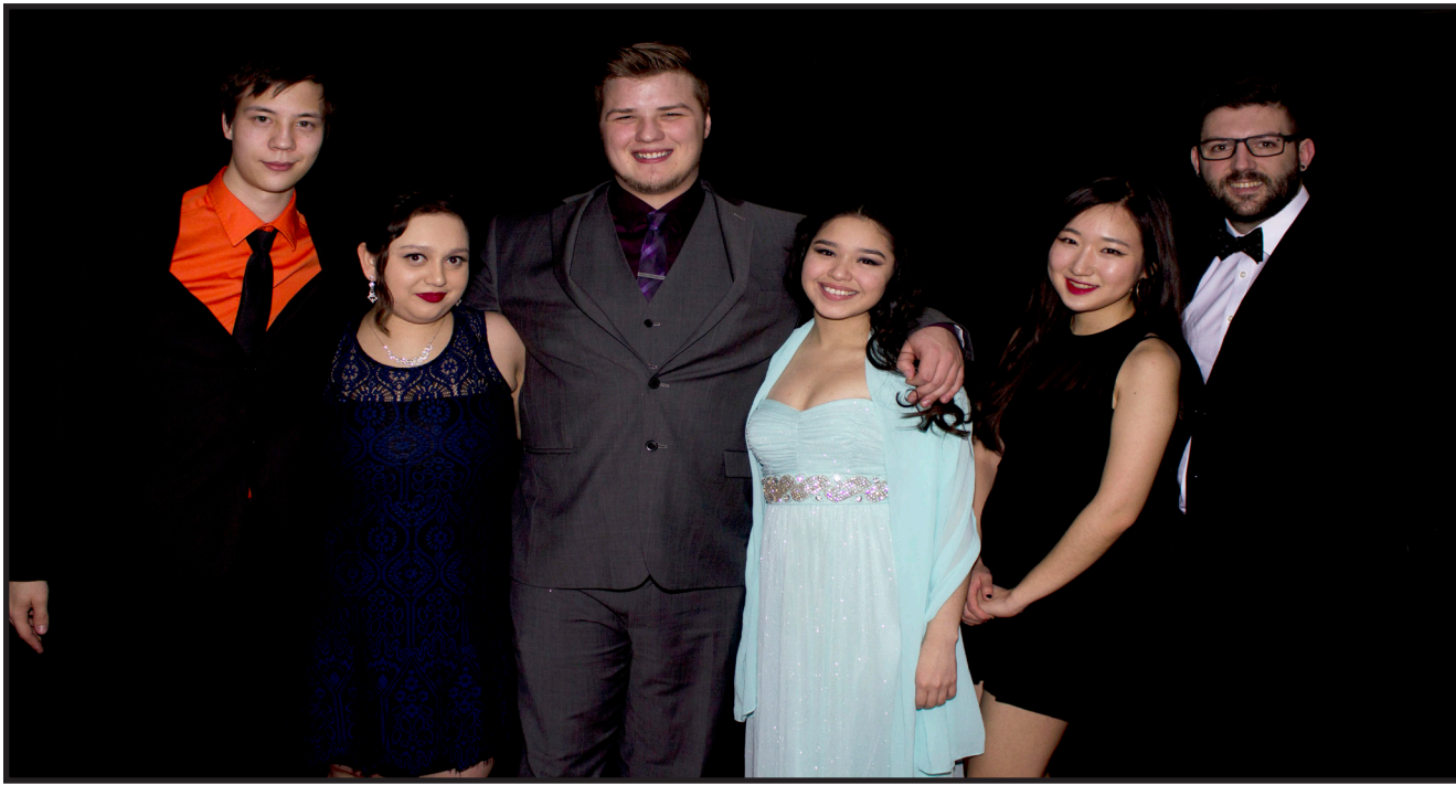
Students' taking the red carpet at the Ladies and Gentlemen's Gala, that took place on Feb 3rd in Crave.